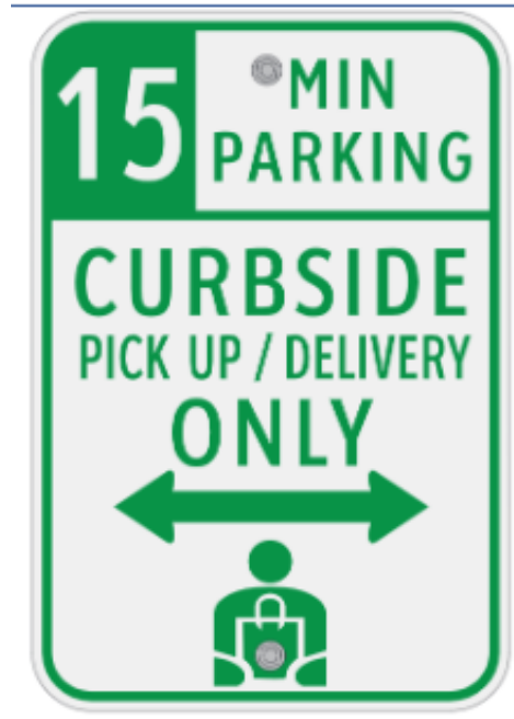
Curbside Pickup Zones